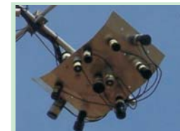
4-channel sensors being used as part of a GIS based analysis of ground water quality in Senegal.