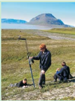
BSES expedition to Greenland. NDVI system used for the study of vegetation characteristics for low arctic vegetation