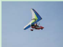
Skye 4-channel sensors are mounted on this microlite aircraft for studying aerosol & radiation interaction