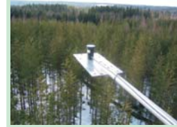
Skye 2-channel sensors on an Eddy-Covariance Tower.